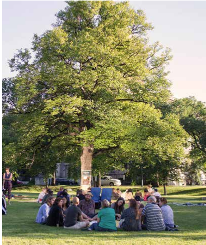
Indigenous Newcomer Relations event by 13 Fires, 2016