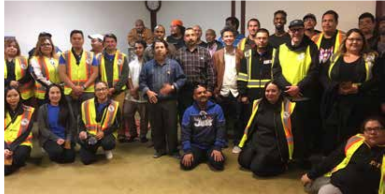
Moose Hide Campaign Breaking of the Fast at the Mosque, 2018

within the child welfare system. A number of other causes that move beyond differences toward shared struggles and goals include environment degradation, climate change and food security.