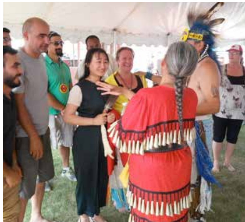
Ethno-cultural communities visit to Brokenhead Reserve, 2018