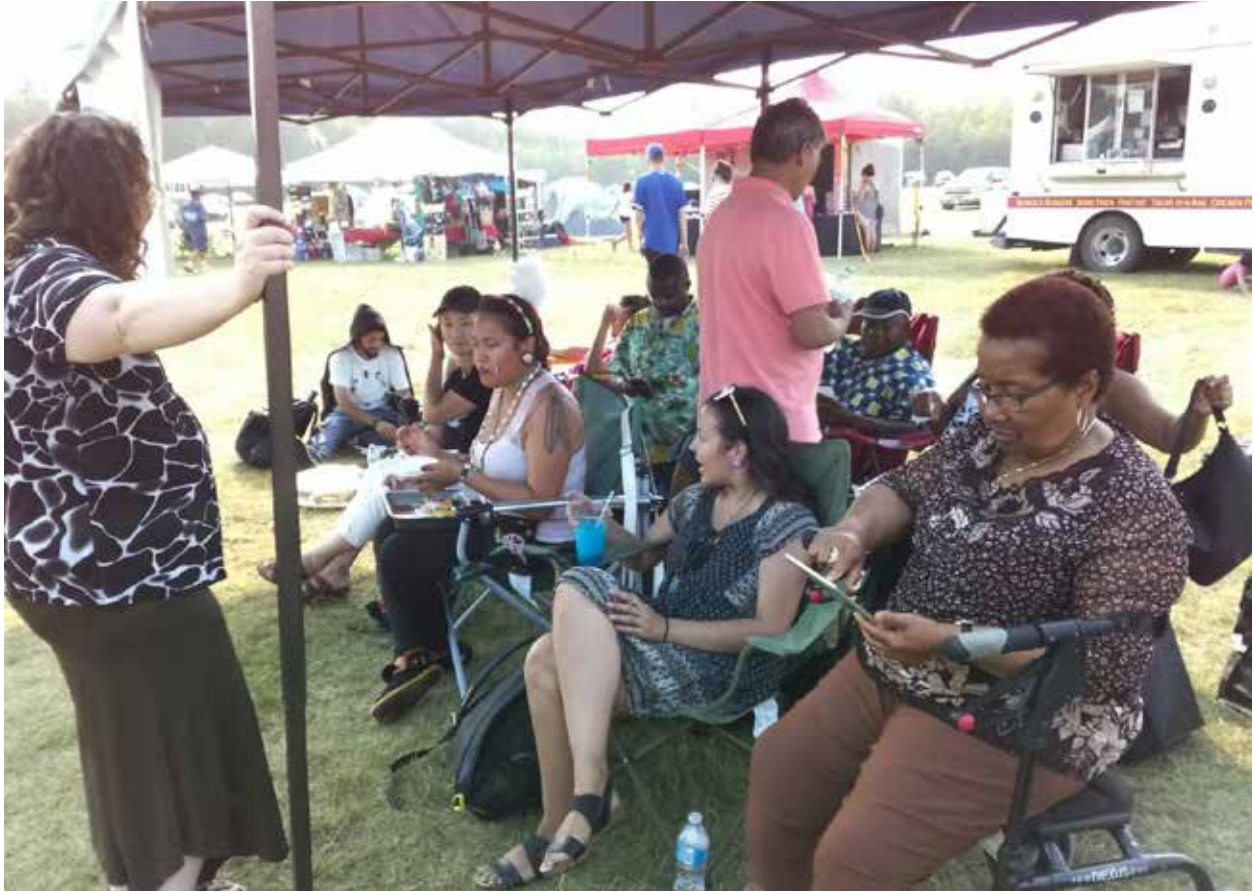
Ethno-cultural communities visit to Brokenhead Reserve, 2018