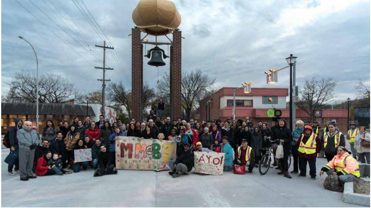
Meet Me @ Bell Tower welcoming newcomer and Muslim communities, 2016