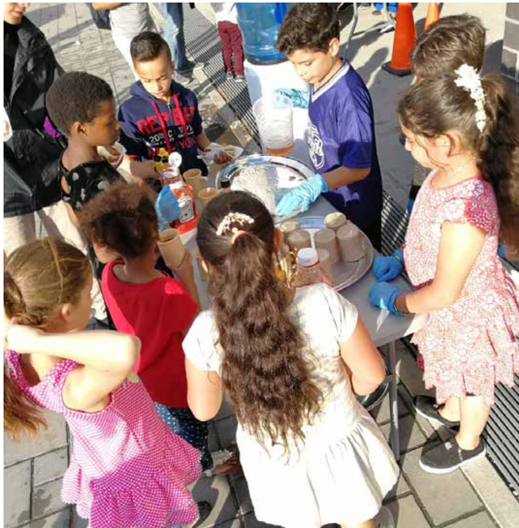
Meet the Neighbour BBQ at IRCOM, 2017