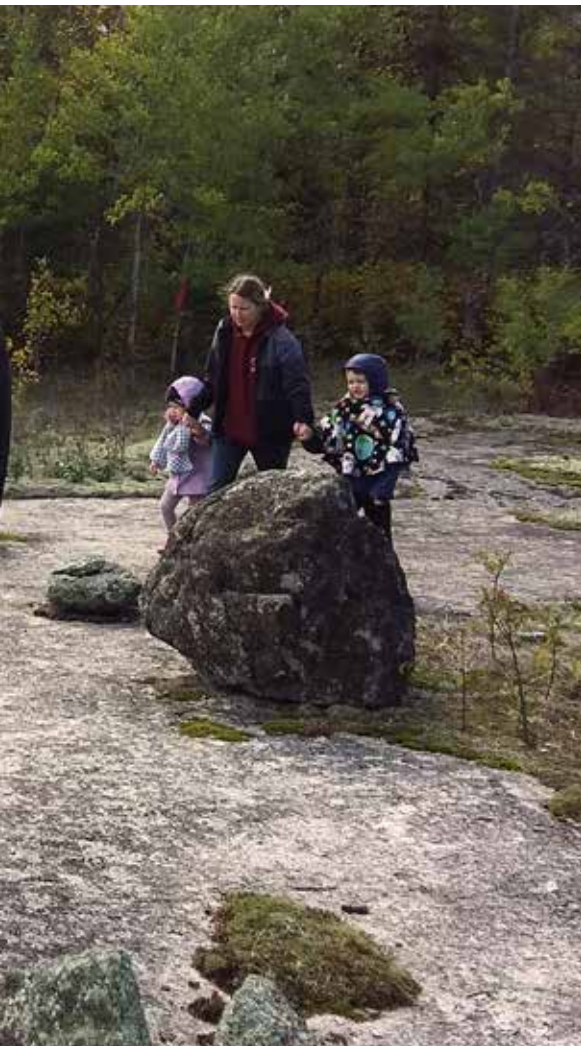
IRCOM trip to a Petroform, 2019