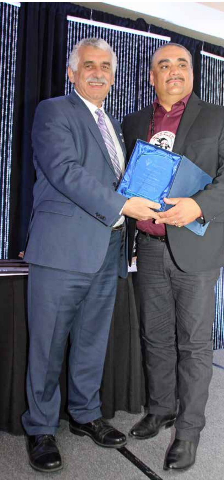
Bear Clan Award at ISSA fundraising dinner, 2017

Having the presence of community leaders who are Indigenous in newcomer circles shifts things really significantly.