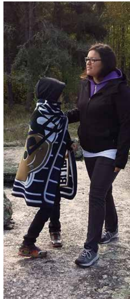
Meet the Neighbour BBQ at IRCOM, 2017