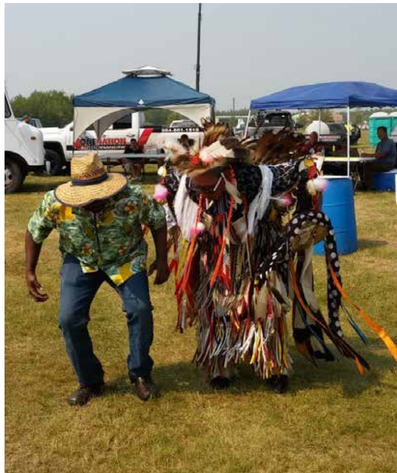
Ethno-cultural communities visit to Brokenhead Reserve, 2018