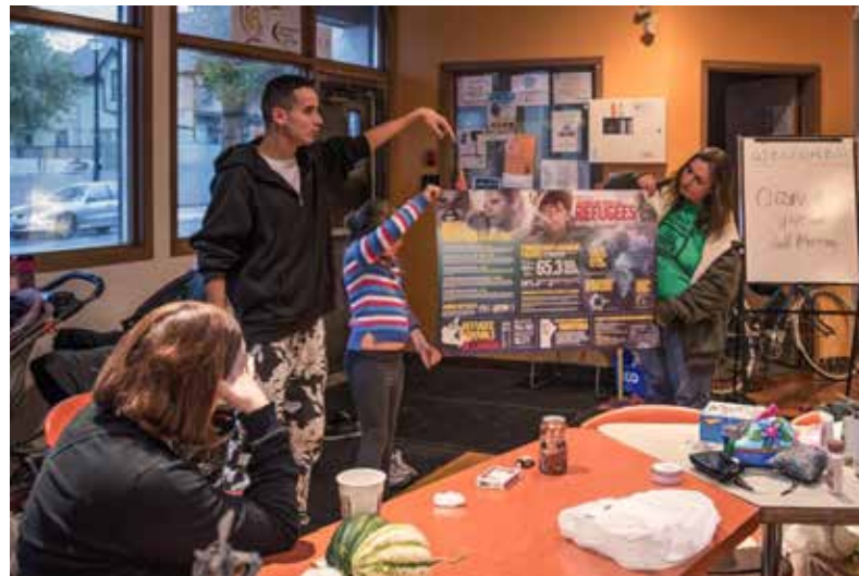
Discussion about refugees at a Meet Me @ Bell Tower event, 2016