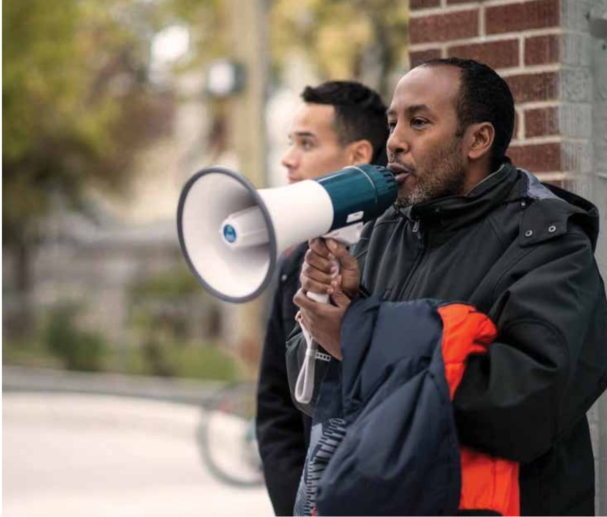
Meet Me @ Bell Tower welcoming newcomer and Muslim communities, 2016.