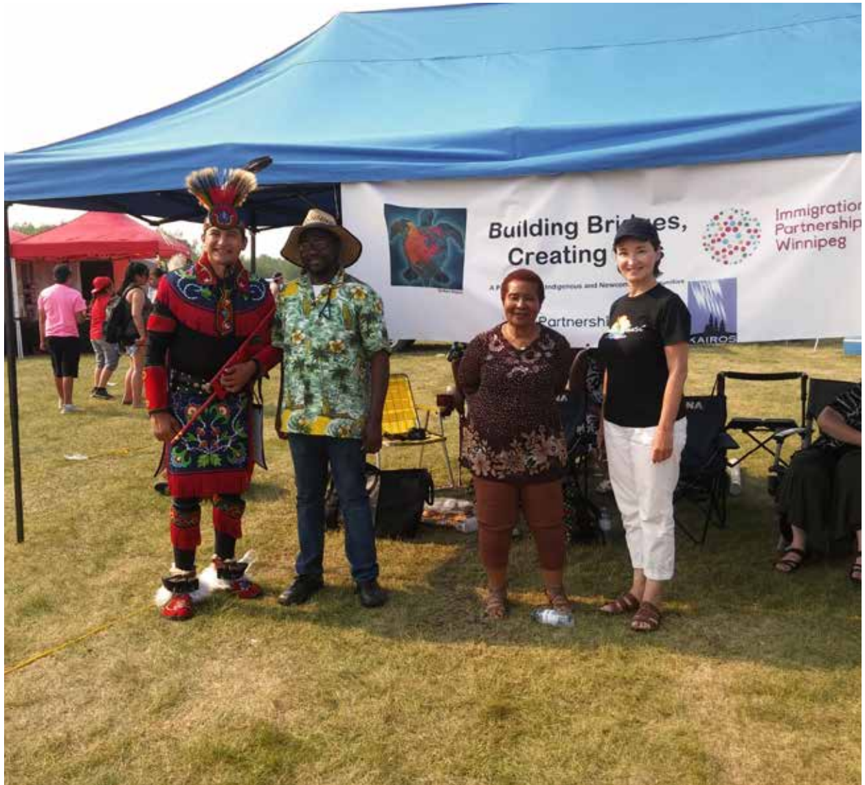
Ethno-cultural communities visit to Brokenhead Reserve, 2018