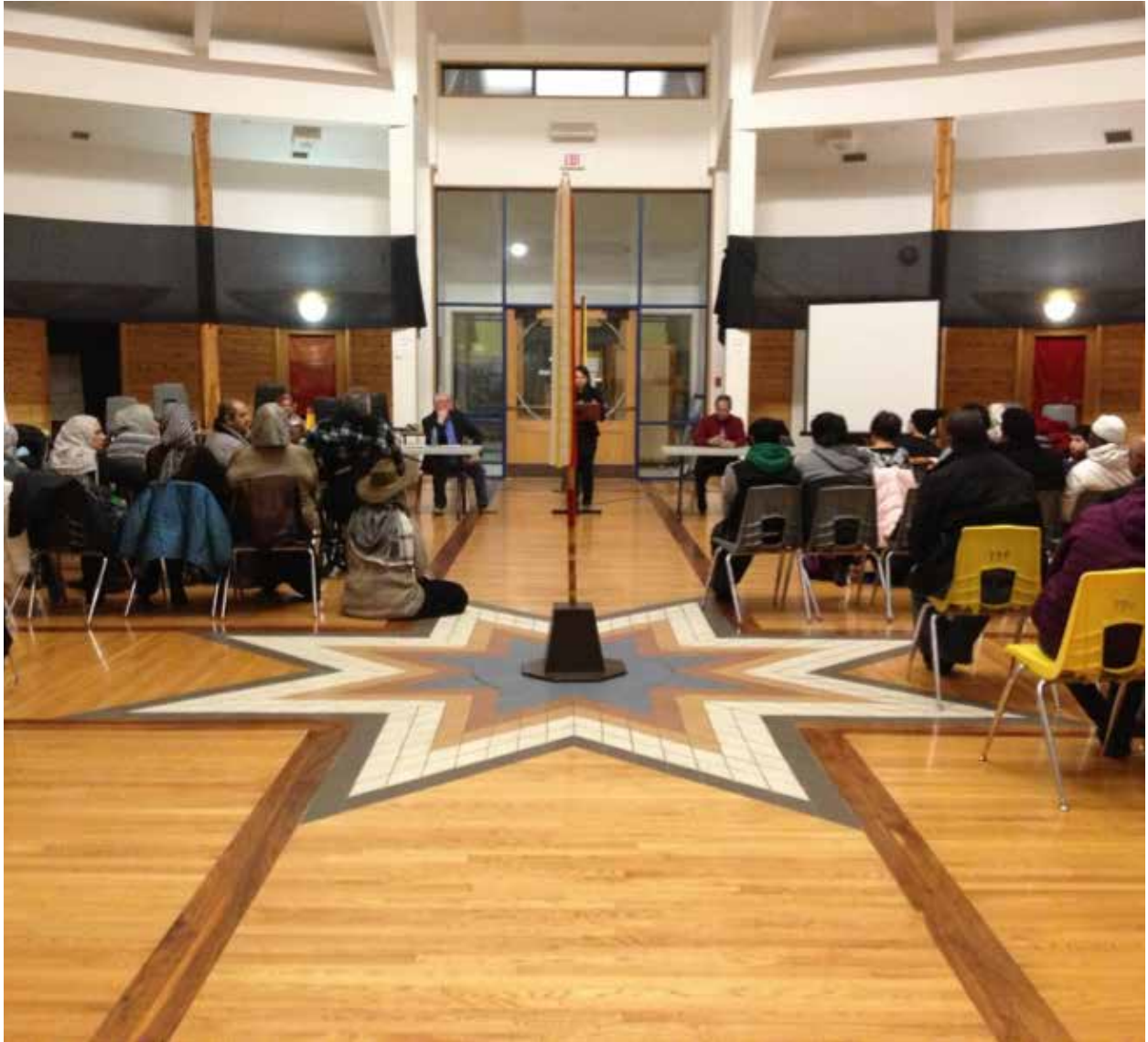
Public Square Series – An evening with the Indigenous community, 2013