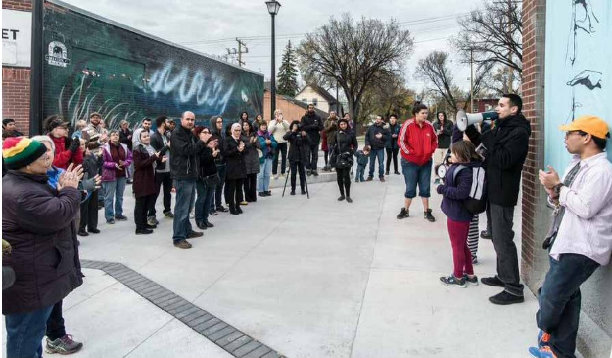
Meet Me @ Bell Tower welcoming newcomer and Muslim communities, 2016