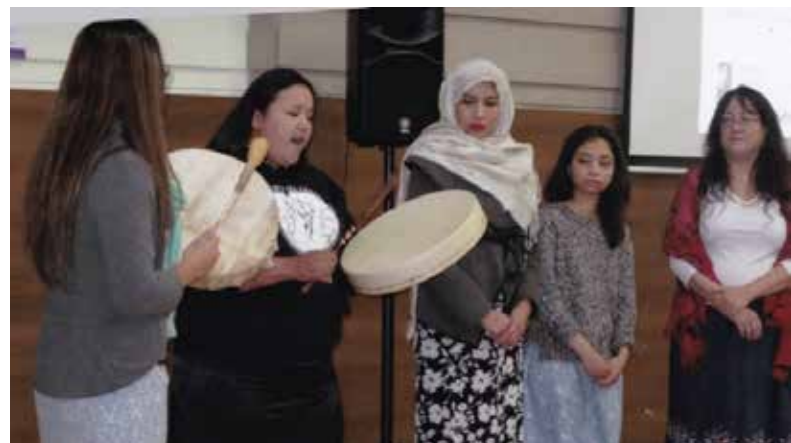
'Sister to Sister' bringing together Indigenous and Muslim women, 2015

One approach proposed to ensure meaningful processes of relationship-building was mentorship. Mentorship enables people to work with and get to know each other. Wherever possible, mentorship should be delivered through land-based and experiential activities. The active involvement of mentors of Indigenous ancestry was considered necessary in organizations serving newcomers. Furthermore, participants also prioritized alternative opportunities for cross-cultural relationship-building based on gender, age, religion and place of residence.