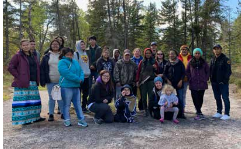
IRCOM trip to a Petroform, 2019

Furthermore, certain segments of newcomers who come from rural agrarian areas may appreciate land-based activities as cities may become alienating. Outdoor