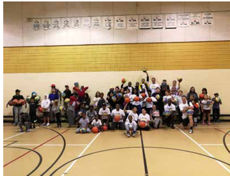
100 Basketballs campaign, 2018