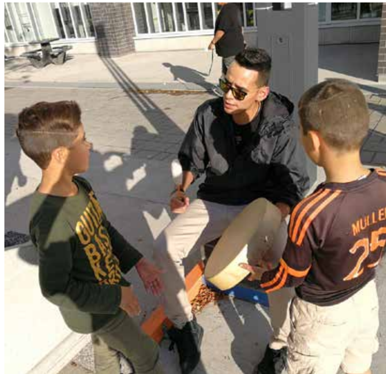
Meet the Neighbour BBQ at IRCOM, 2017