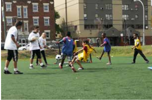
100 Soccer Balls campaign, 2018

sports, which can support opportunities for cross-cultural exchange. However, engagement in sport requires more sports programs, facilities and affordable equipment to engage different segments from both communities.