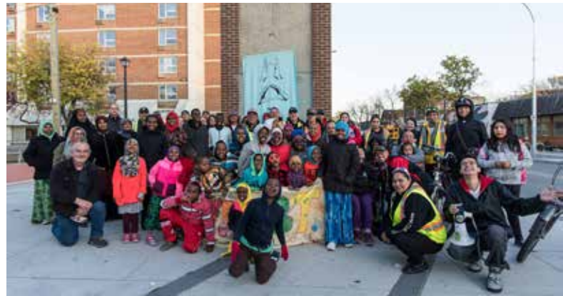
Bell Me @ the Bell Tower welcoming IRCOM, 2017

Although young people may be more receptive to interactive and experiential approaches, adult learners may require further engagement to show them the importance of such approaches. Moreover, activities should encourage young and adult learners to lead similar sessions within their own families and communities. Keeping in mind that settlement orientation typically happens in informal settings, a significant step is to involve learners wherever possible in the planning process with an overarching goal to equip and empower them with tools.